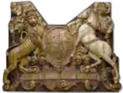
The Coat of Arms from the stern of the Royal Charles

The English were taken aback by the skill with which the Dutch managed their escape. Samuel Pepys noted the seamanship with which they removed the Royal Charles, heeling her over to reduce her draught, so that she cleared the mud. In fact, she proved too large for use in the shallow waters of the Low Countries. The Dutch scrapped her in 1673. The coat of arms from her stern was saved. It remains on display in Amsterdam to this very day.